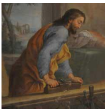
Patron of Workers

Saint Joseph, you devoted your time at Nazareth to the work of a carpenter. It was the Will of God that you and your Foster-Son should spend your days together in manual labour. What a beautiful example you set for the working classes!